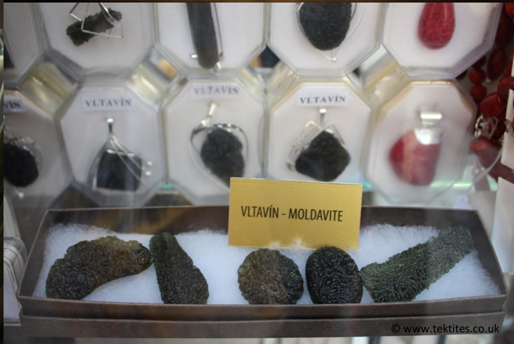
This mineral shop had a great selection, including some rough stones.